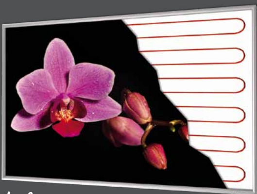
Infrared heating panel